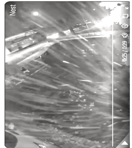
The moment when a so-called IED exploded a uLez enforcement camera in Sidcup

Quick to join the opportunity to blacken anti-uLez protesters without first knowing the facts, the mayor’s office told News Shopper : “The blowing up of a uLez camera in Sidcup was grotesquely irresponsible behaviour that puts both lives and property at risk”. Counter-terrorism police are leading an investigation, the free sheet reported adding Police claims that exploding the camera was a “deliberate act”.