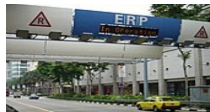
Singapore sling. A pay-per-mile road charging monitoring gantry