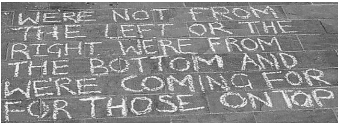
Graffiti seen after Khan insulted anti-uLez demonstrators as "far-right, Covid deniers, vaccine deniers, climate deniers, and some even Tories"

If you don't fancy joining any political party then Facebook groups detail future demonstration plans. Some of the groups supporting direct action are: