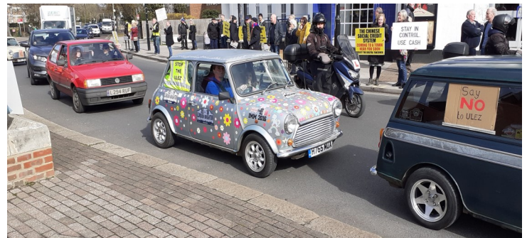
Campaigning vehicles out on manoeuvres in Beckenham

The security car had tailgated our car ignoring safe braking distance (30mph 75 feet, 40mph 118 feet) recommendations.