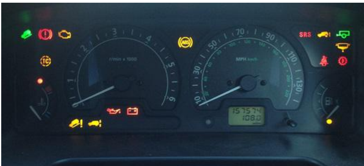
This Photo is from a 2003 TD5 D2 Manual, with SLS , without ACE. At just ignition switched on position.