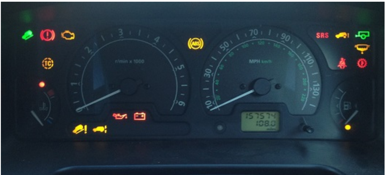
This Photo is from a 2003 TD5 D2 , with SLS , without ACE. At just ignition switched on.